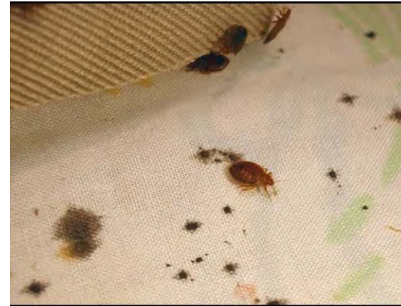
Bedbugs on a mattress.

Bedbugs can live 12 months or more without eating! If you try to keep your mattresses or other items, like clothes or bedding, you may need to keep them in a plastic container or a plaster cover for that amount of time.