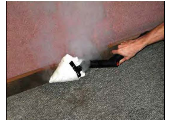
Steam cleaning to kill bedbugs!