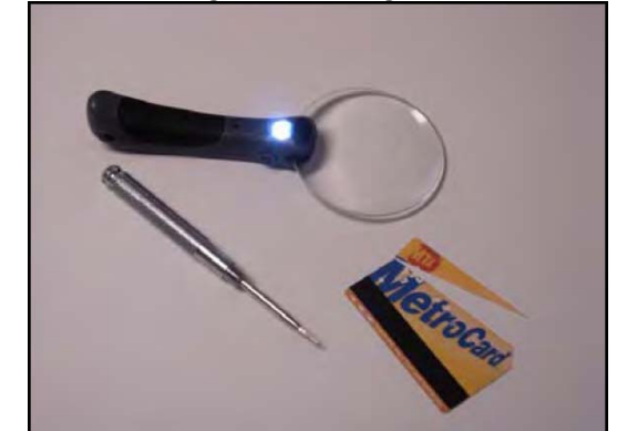
Tools for finding bedbugs in cracks